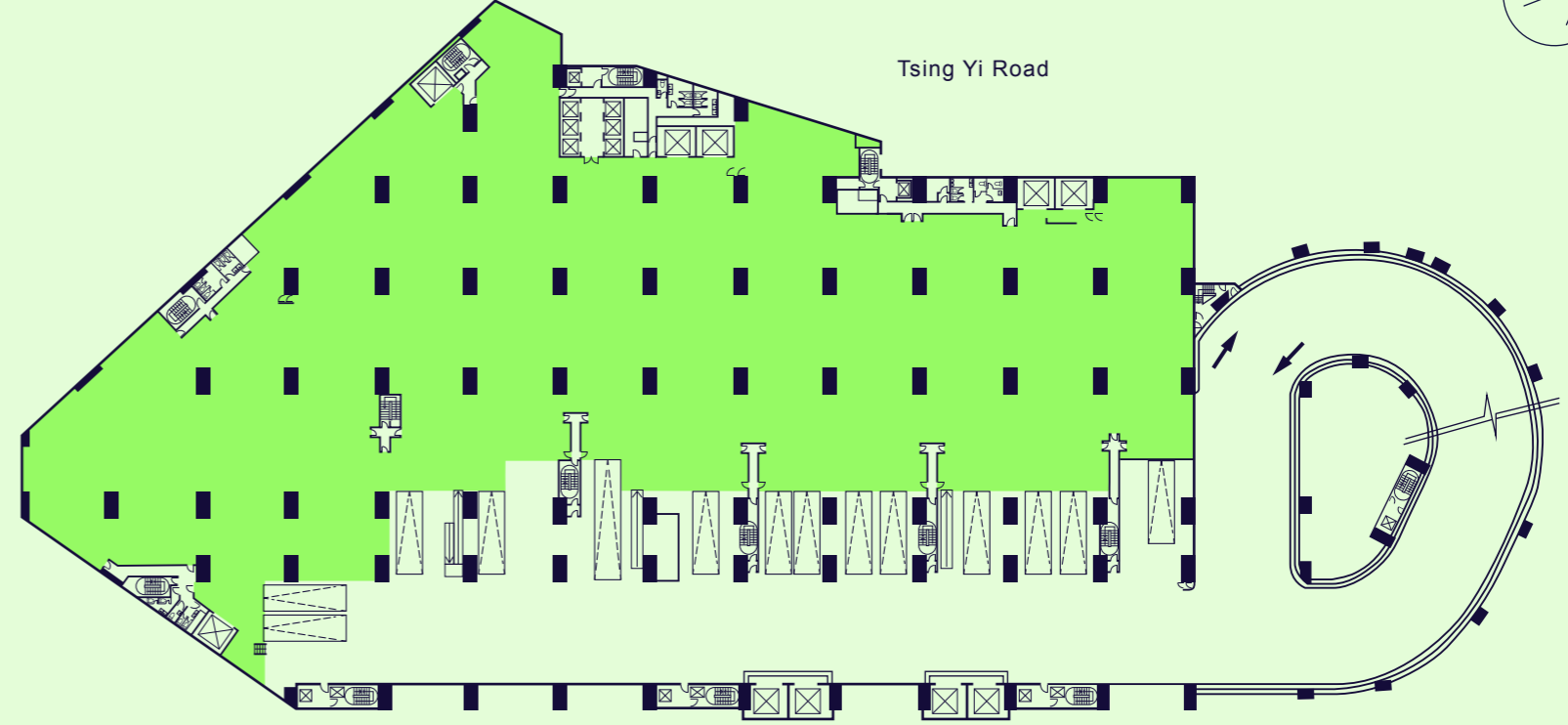
Floors 1-15 (ramp-access) 1-15樓層 (可經車道直達)